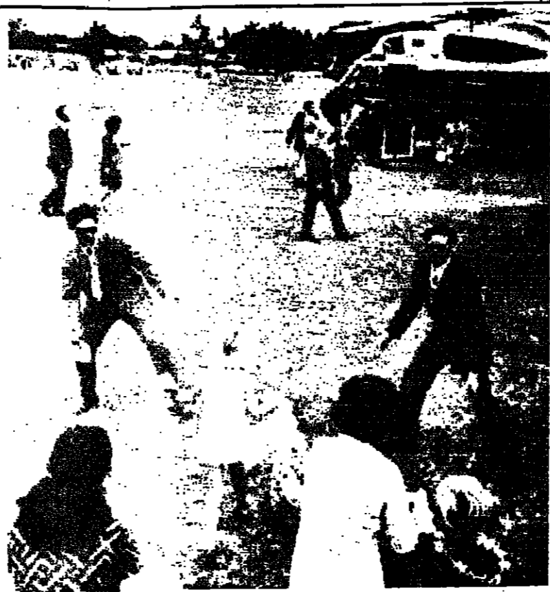
Secret service agents leap into action to prevent little girl from running up to President Nixon as he walks from helicopter (background) near a Honolulu shopping centre on Wednesday evening. Later Mr. Nixon walked up to the girl and accepted her flowers.